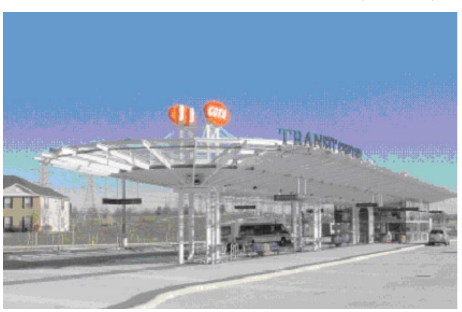
Easton Transit Center, Columbus, OH

The following case studies illustrate a variety of sites, partnerships, and funding arrangements which were successful in meeting the needs of working families and transit riders.