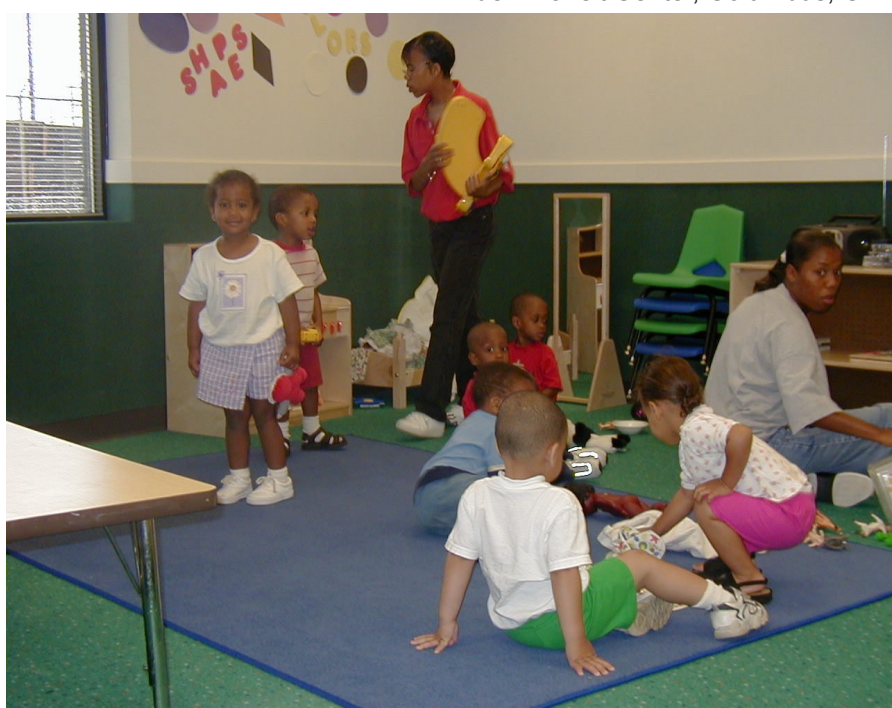
Linden Transit Center, Columbus, OH