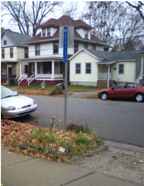
Example of “Board Bus at Corner” sign

Metro Transit currently serves just over 2,000 unique bus stop locations. About 1,000 of these signs are expected to lack any information on the rear side of the signage at present. The Committee proposes a pilot project to mark both sides of bus stop signs. The pilot project would consist of applying an adhesive sticker, produced by the City of Madison sign shop, to the rear sides of bus stop signs. Metro should pick a trial route to test, install these stickers and collect passenger feedback. If the presence of stickers makes it easier to identify stops and thus to ride the bus, they should be placed on all remaining signs.